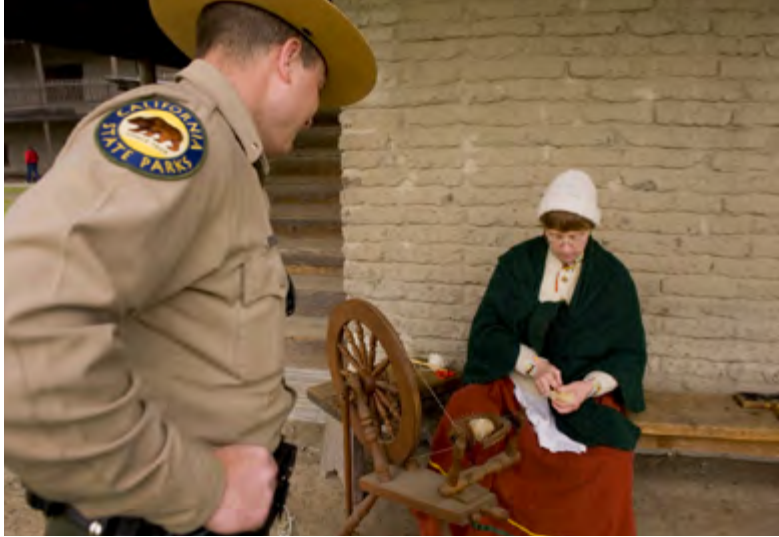
A second interpreter enhances first person characterization.