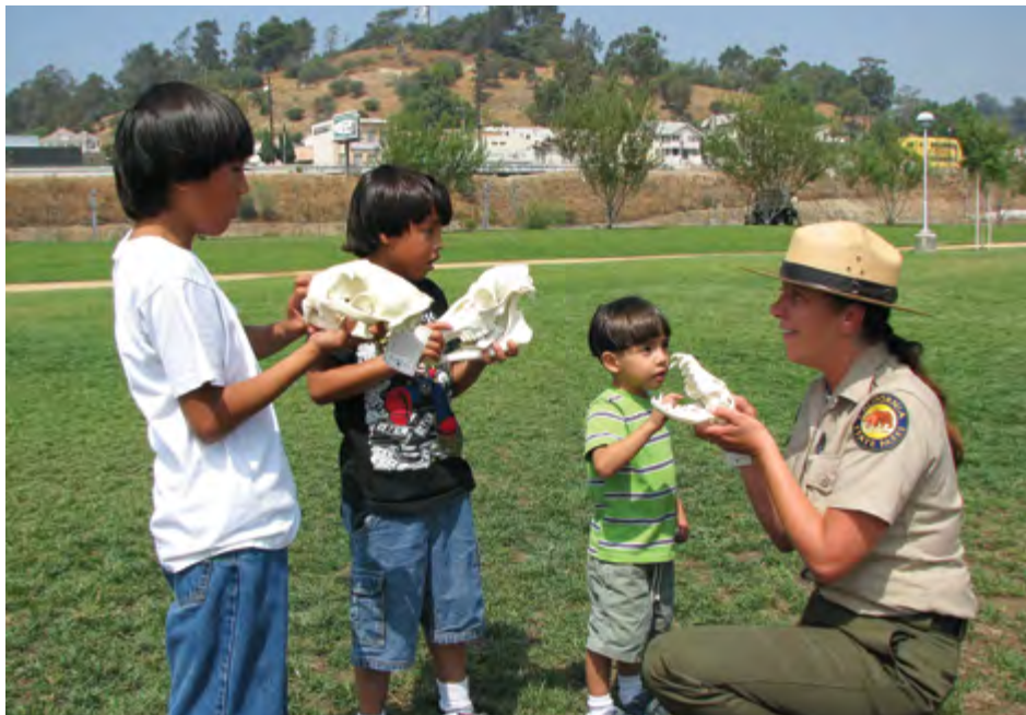
Touch is a powerful sensory stimulus.

Incorporating tactile sensation is extremely successful at reinforcing messages. For example, touching the ground to test the temperature with one hand in the sun and the other in the shade clearly illustrates the difference a tree can make. The rough texture of bark or the smoothness of polished marble cannot be explained any better than by touch. Touching the hairs on plants shows how they manage to “hitchhike” on your socks and disperse widely.